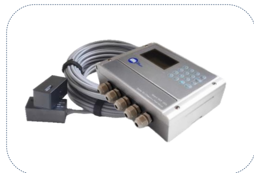
MUF 1200 (1%) Clamp on Ultrasonic Meter

For assessing the performance and efficiency of fluid systems, the MUF 1200/MUF(B) 1200 Clamp on Transit Time Ultrasonic Flow/Btu Meter delivers unmatched accuracy. Whether it's evaluating the effectiveness of pumps or monitoring regulating valves, this meter provides comprehensive insights. Its ability to measure both flow and thermal energy facilitates thorough performance assessments, enabling proactive maintenance and optimization strategies.