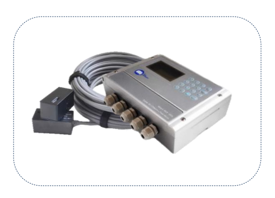
MUF 1200 (1%) Clamp on Ultrasonic Meter

For assessing the performance and efficiency of fluid systems, the MUF 1200/MUF(B) 1200 Clamp onTransit Time Ultrasonic Flow/Btu Meter delivers unmatched accuracy. Whether it's evaluating the effectiveness of pumps or monitoring regulating valves, this meter provides comprehensive insights. Its ability to measure both flow and thermal energy facilitates thorough performance assessments, enabling proactive maintenance and optimization strategies.