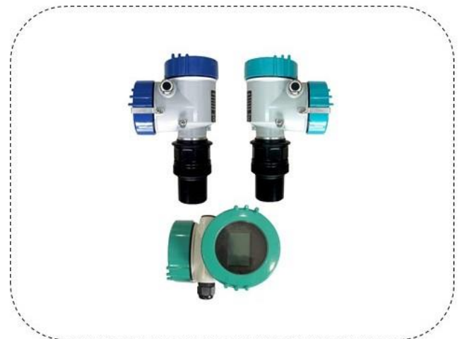
MULR Ultra Sonic Leel Sensor

In pharmaceutical manufacturing, the MULR ultrasonic level sensor manage liquid levels in various processes, ensuring precision and hygiene. Accurate level measurement is vital for the consistency and quality of pharmaceutical products. The sensor's non-contact measurement method is ideal for maintaining the sterility required in this industry.