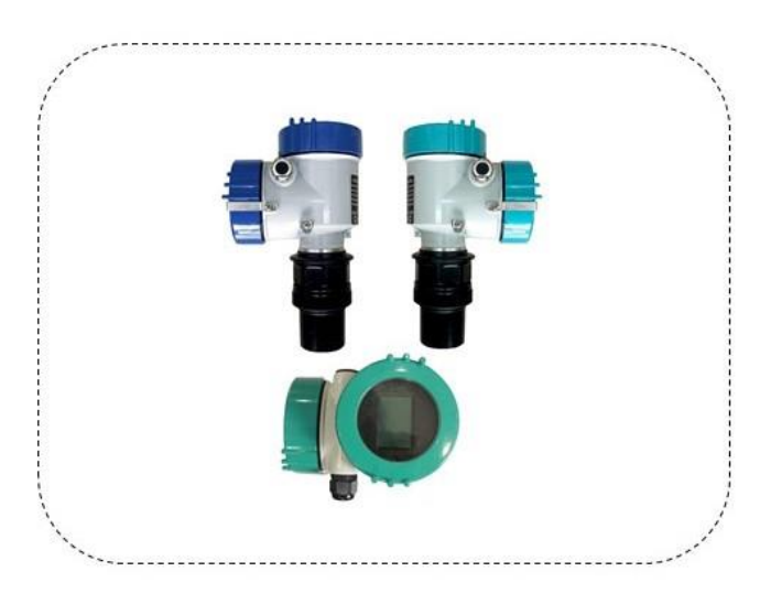
MULR Ultra Sonic Leel Senser

In pharmaceutical manufacturing, the MULR ultrasonic level sensor manage liquid levels in various processes, ensuring precision and hygiene. Accurate level measurement is vital for the consistency and quality of pharmaceutical products. The sensor's non-contact measurement method is ideal for maintaining the sterility required in this industry.