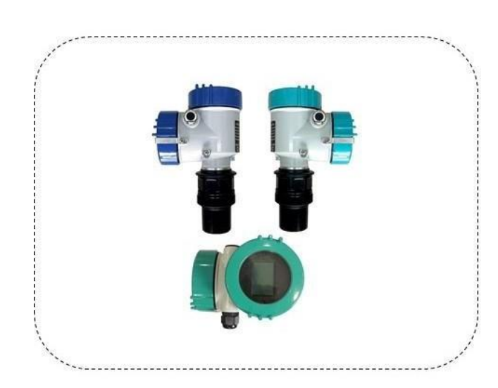
MULR Ultra Sonic Leel Senser

In pharmaceutical manufacturing, the MULR ultrasonic level sensor manage liquid levels in various processes, ensuring precision and hygiene. Accurate level measurement is vital for the consistency and quality of pharmaceutical products. The sensor's non-contact measurement method is ideal for maintaining the sterility required in this industry.