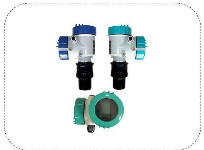
MULR Ultra Sonic Leel Sensor

In pharmaceutical manufacturing, the MULR ultrasonic level sensor manage liquid levels in various processes, ensuring precision and hygiene. Accurate level measurement is vital for the consistency and quality of pharmaceutical products. The sensor's non-contact measurement method is ideal for maintaining the sterility required in this industry.