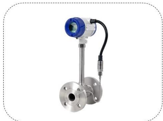
Vortex Fow Meter

Vortex flow meters in heat-supply systems accurately measure fluid flow rates, optimizing heat transfer efficiency. They monitor the flow of hot water or steam in heating networks, ensuring precise distribution and energy conservation. These meters offer reliability, low maintenance, and compatibility with high temperatures, essential for effective heat-supply system operation.